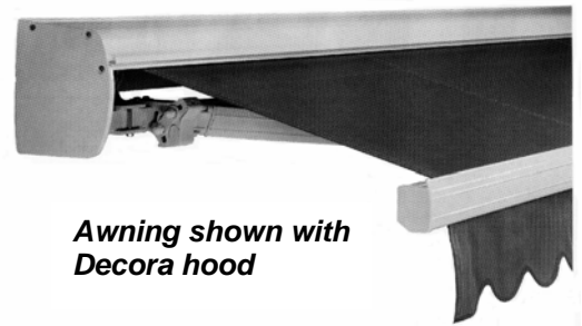
Awning shown with Decora hood