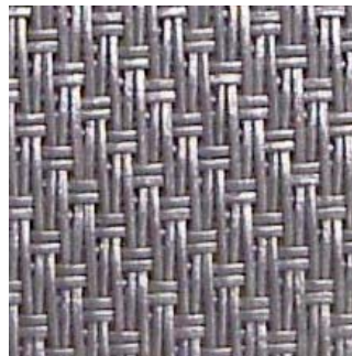
6 % open mesh