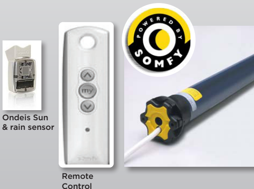
Ondeis Sun & rain sensor

SOMFY MOTORS feature an integrated radio receiver that allows you to operate the shade by remote. The optional “Sunis” sun sensor will extend the shades automatically when shade is needed. A wind sensor can be added that gives the extra protection from wind by retracting automatically.