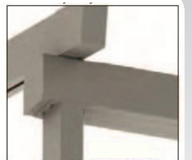
with Tecnic Profile