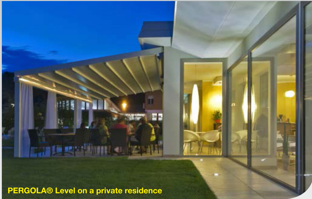
PERGOLA® Level on a private residence

For the ultimate comfort, add rolling zippered side shades with mesh fabric to eliminate the sun's glare and keep bugs from entering the space. The roll down shades can also be fitted with heavy duty vinyl fabric and clear vinyl windows for keeping moderate weather at bay.