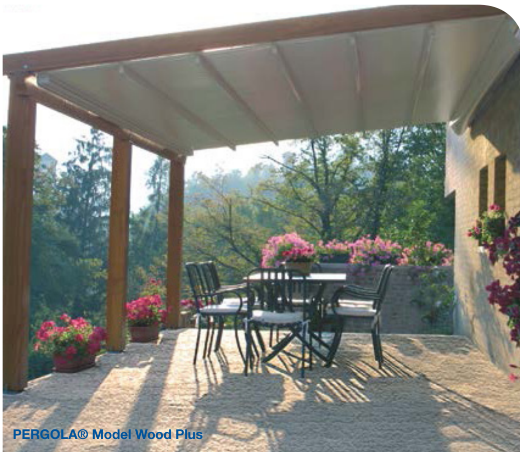
PERGOLA® Model Wood Plus

All Pergola® models are custom built to fit each area. The fabric is manufactured in one piece, even on wider awnings to prevent water leaking. Wider units therefore have multiple framing supports added to ensure a strong framework. Multiple units can also be mounted together with a gutter system in between for even wider widths. An integrated guttering system avoids water leakage.