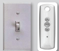
Standard Switch Remote Control

Frame colors may vary due to the printing process. CUSTOM COLORS ARE AVAILABLE